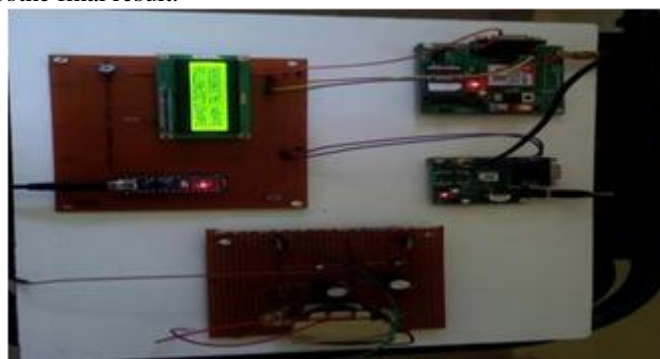
Figure 2: Hardware set up of system.

Figure 2 shows the hardware setup of system and Figure 3 shows the tracking location when user pressed the key that shows the final result.