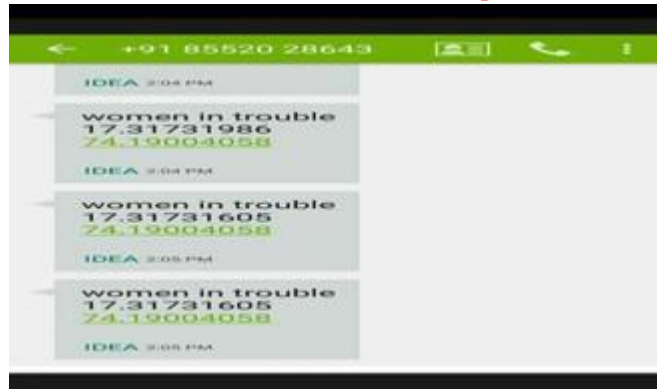
Figure 3: Tracking location