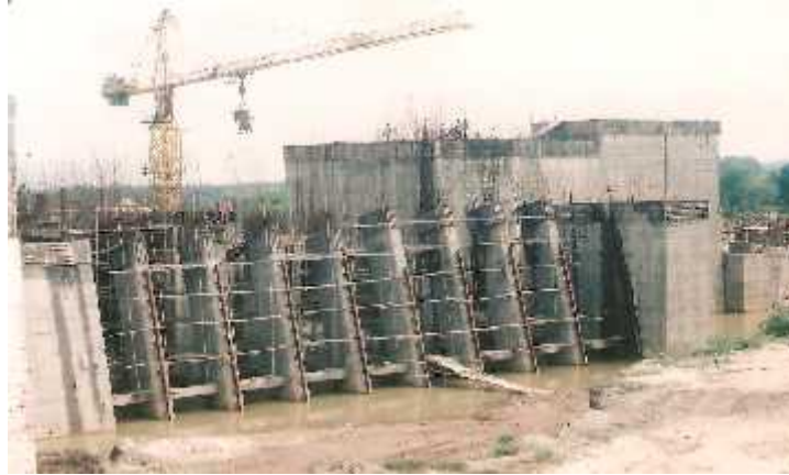
Photograph 5: A back view of Upper Tunga power block