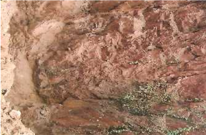
Photograph 3: A View of schistos rock formation excavation of left bank of UTP