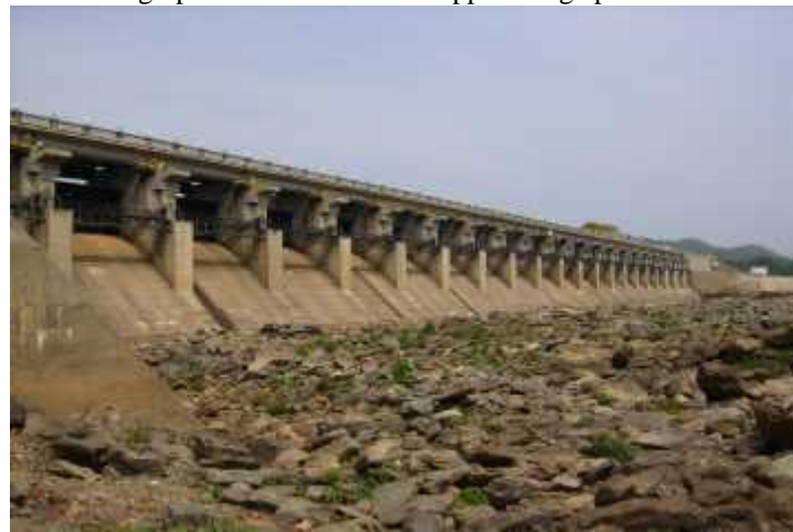
Photograph 6: A View of Final Stage of UTP