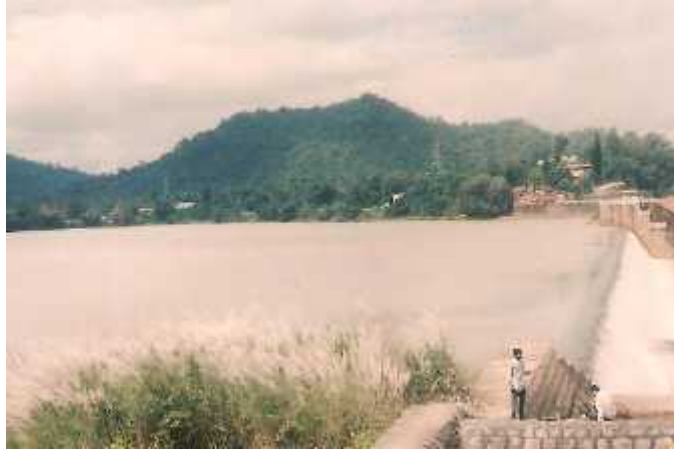
Photograph 1: A View of Tunga Anicut open spillway