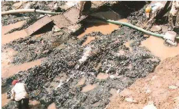
Photograph 4: A View of foundation basement structures of block-17