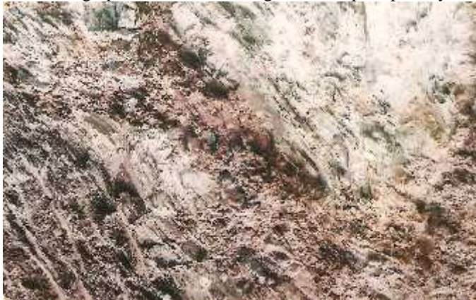
Photograph 2: A View of schistos rock formation excavation of right bank of UTP